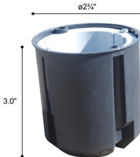
Concrete Pour Box (CPX)

Lumux reserves the right to modify the above details to reflect changes in the cost of materials and/or design without prior notice.